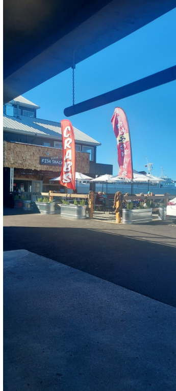
Left: New Restaurant at the Wharf. Give it a look, great energy!