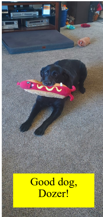
Good dog, Dozer!