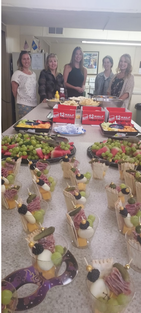
Left: Lincoln High School Prom 2023