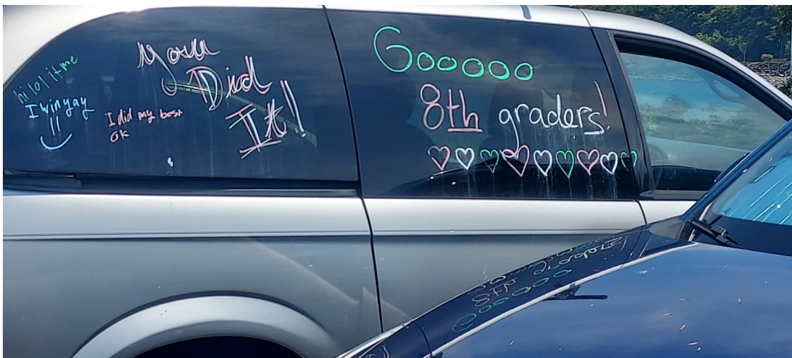
Below: Let's hear it for the eight graders!