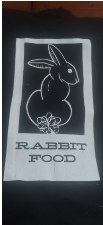
Rabbit Food A new business on 8th Street