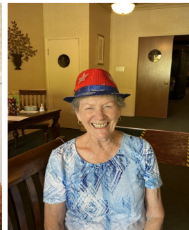
Pictured from left to right: