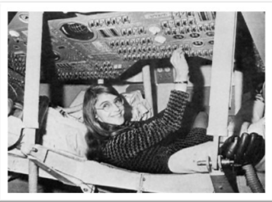
Hamilton in the Apollo Command Module

Margaret Hamilton is a computer scientist and systems engineer who was the Director of the Software Engineering Division of the MIT Instrumentation Laboratory, which developed on-board flight software for the Apollo space program. Were it not for Hamilton, Neil Armstrong might not have walked on the moon in 1969. Hamilton worked hard to gain hands-on experience during a time when computer science and software engineering courses or disciplines were non-existent. What's even more unusual is that she was a working mother. At NASA, Hamilton supervised the