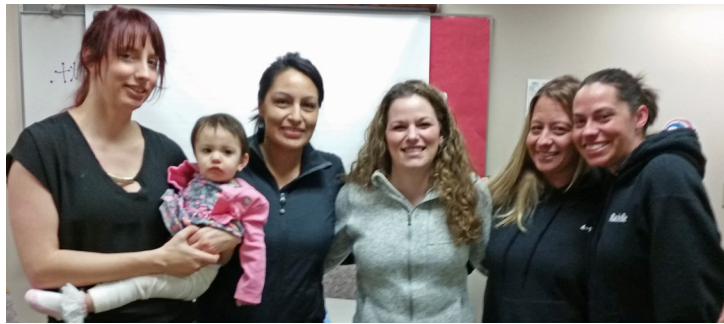
Above: Live Your Dream Recipients and Friends