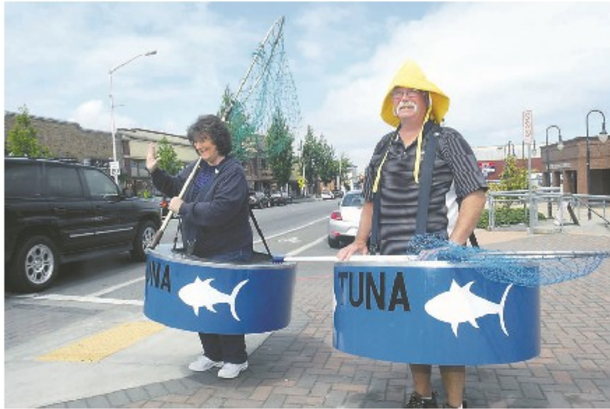
From the Peninsula Daily News Friday, June 27, 2014